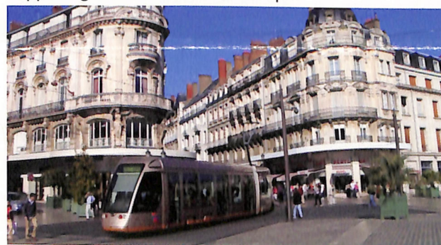
ABOVE: The picturesque city of Orléans will have Keolis operated trams from January next year.

In the next edition of The Wire we'll show you what's happening around the rest of Europe.