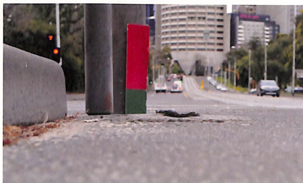
ABOVE: This flood indicator on Wellington Parade shows drivers when it is not safe to take a tram through water.

If your tram enters water that is deeper than 10 centimetres, lower the pantograph and call the Fleet Operations Centre (FOC) for assistance.