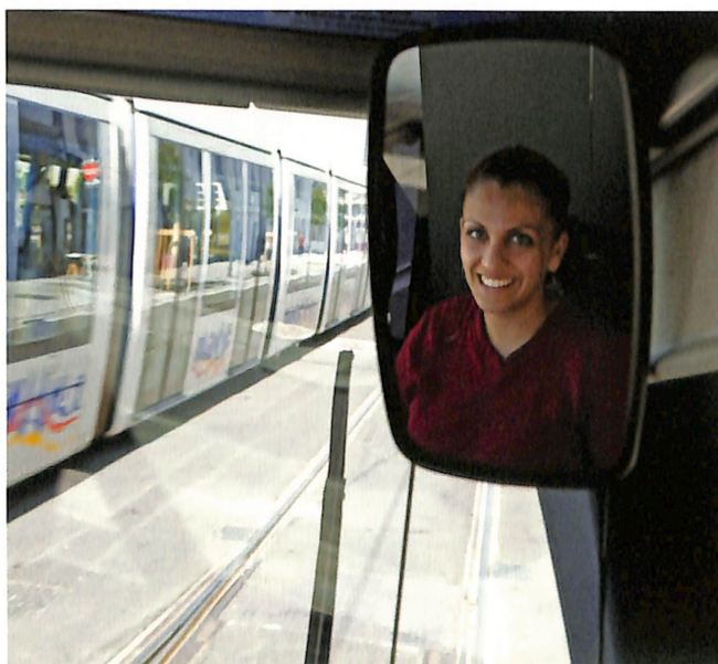
Below: A Keolis employee on the Lyon network in France.