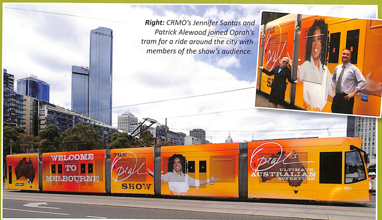
Talk show queen Oprah Winfrey generated much excitement during her visit to Melbourne. Yarra Trams welcomed one of the world's most famous faces with a commemorative tram.