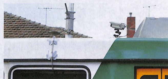
Above: Tram 2056 with computers inside and "trolley cam" on the roof.