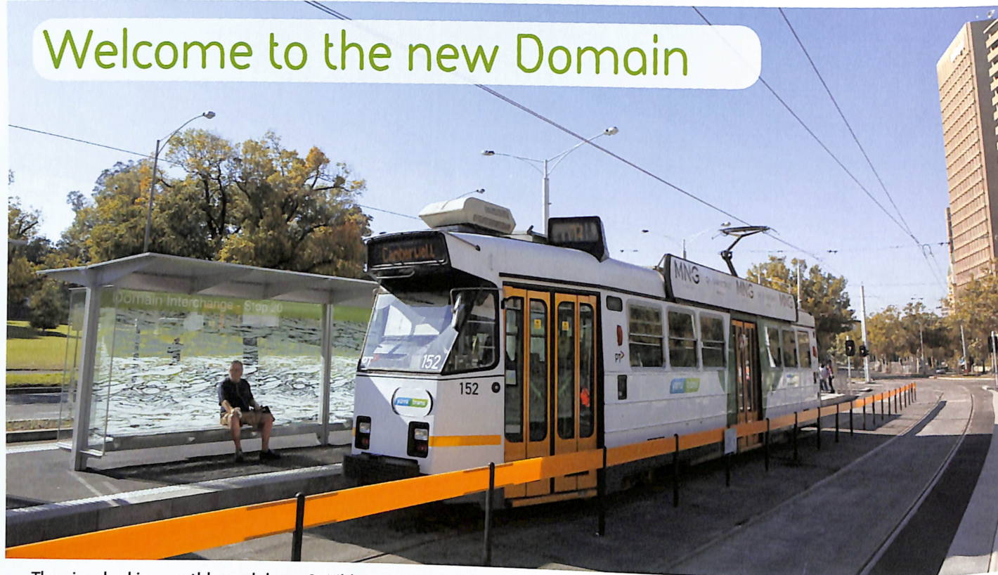
The view looking southbound down St Kilda Road on the first morning of the new stop. Safety barriers have been installed in between tracks to deter pedestrians from making risky crossings between trams.