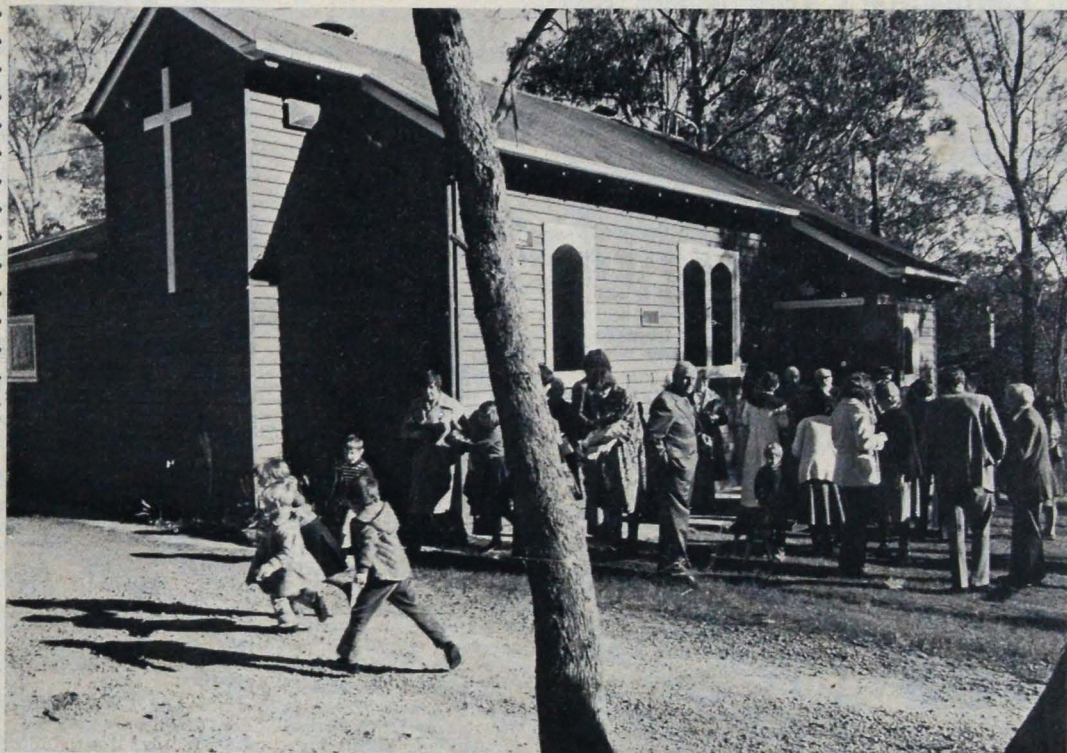
St. Stephen's.. steeped in history.

The club has other big plans for its anniversary season — see Page 12.