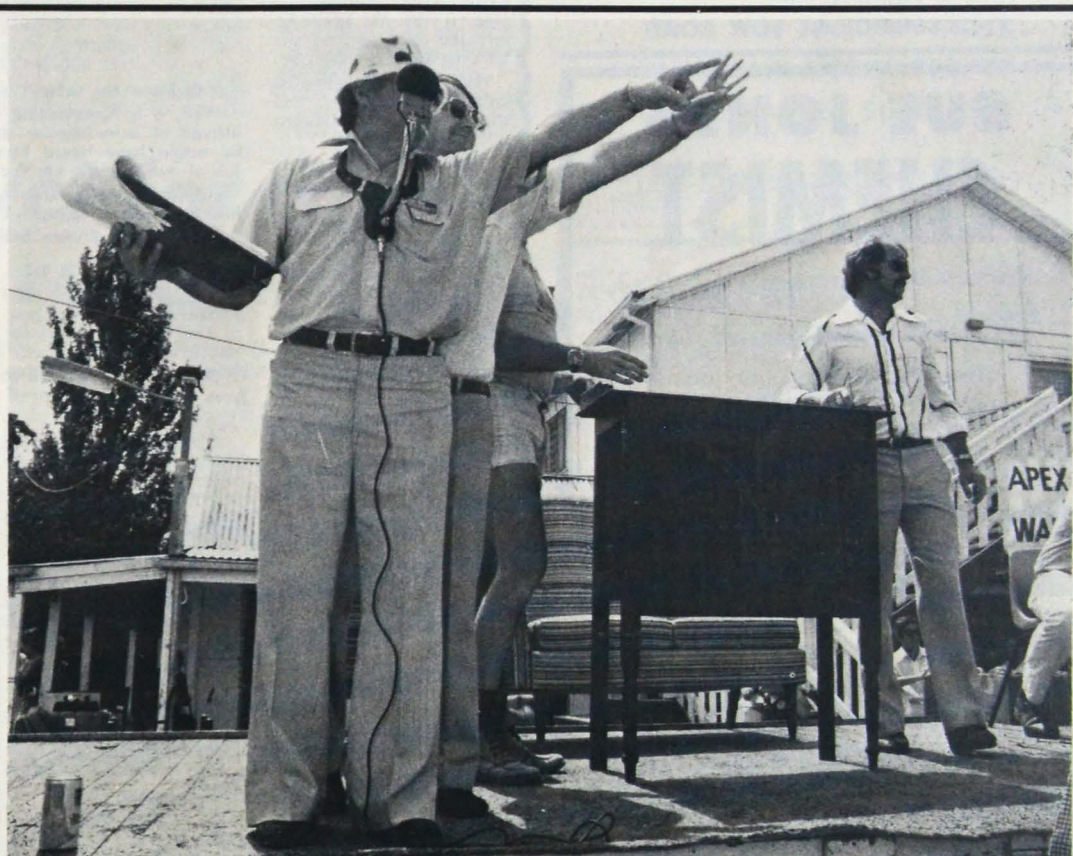
Is it a bird.. is it a plane.. ? No, simply brisk business being done at the Apex Club auction at the Whitehouse.

The profits from the auction will be distributed among several that have Apex support.