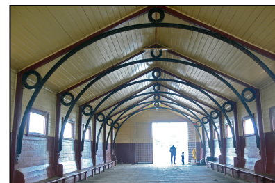
In the jetty shed.