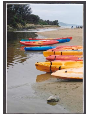
Colourful Canoes - Anne Earnshaw