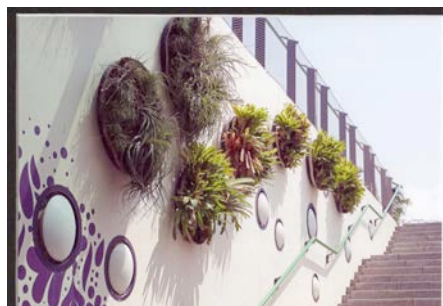
The Tropical Wall - Pam Dellaca