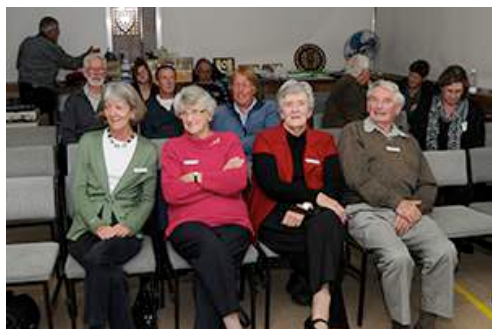
Corio Bay interclub competition

Interclub Competition with Corio Bay was held recently. Full results will be given at the April meeting, however, we were JUST beaten overall. We won the EDIs and Corio Bay won the Large Prints.