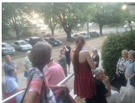
The mob were growing restless!