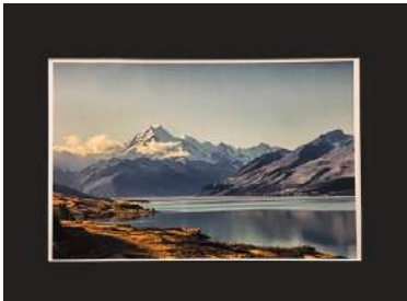
First "Mt Cook" by Neil Sinclair