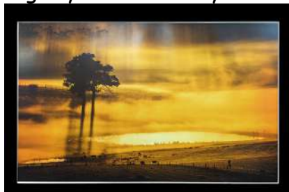
First "Sunrise Through the Fog"