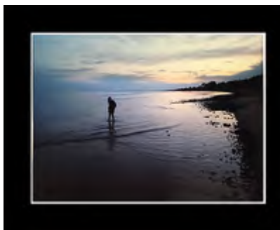
First (No Title) by Grant Allen