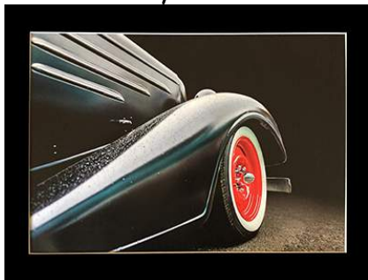
First "Classic Black Rod" by Steve Demeye