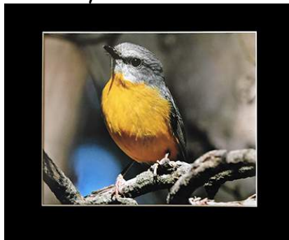
Second "Western Yellow Robin"