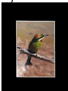
Second "Rainbow Bee Eater" by Sue Barlow