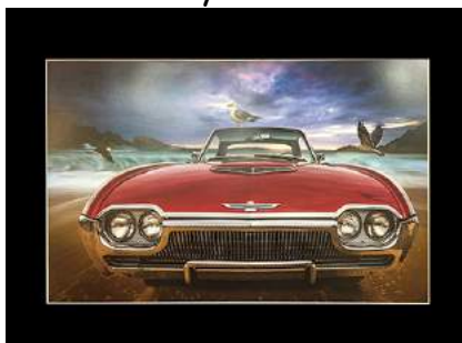
First "Coastal Car Show"