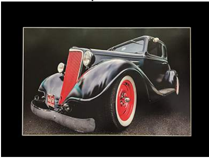
First "Back in Black" by Steve Demeye