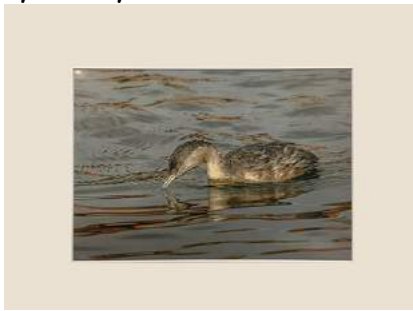
First "Australasian Grebe"