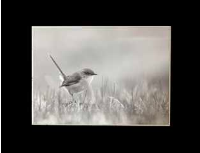
First "Blue Wren in School" by Noel Verlinden