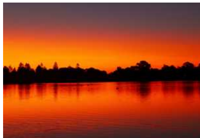
Second "Red Sunset" by Noel Verlinden