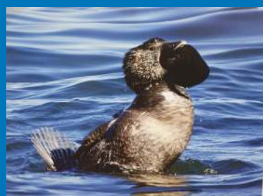
3rd Place - Judy Hearn - "Action Duck"