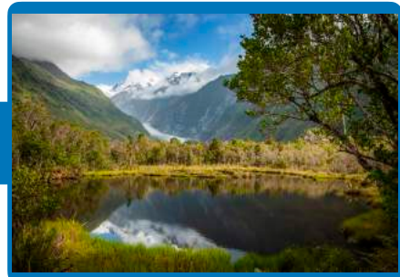
3rd Place - Steve Demeye - "Dam Fine View"