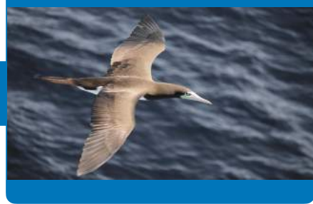
3rd Place - Trevor Parry - "Catching a Thermal"