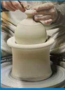
3rd Place - Anne Earnshaw - "Potter At Work"