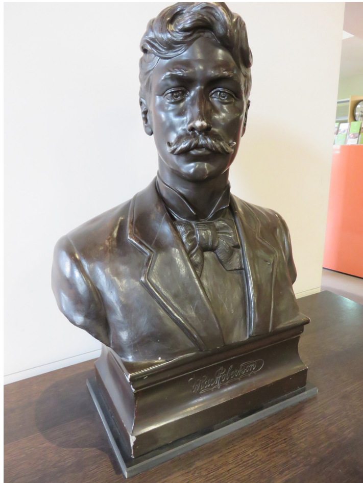
Bust of MacRobertson located at the Fitzroy Library

All digital images, objects and videos can be accessed at Culture Victoria